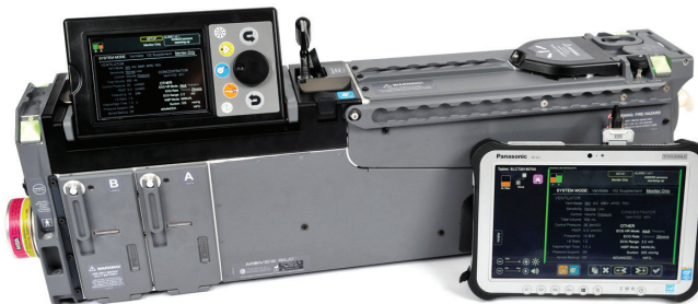
Remote Control Display Module